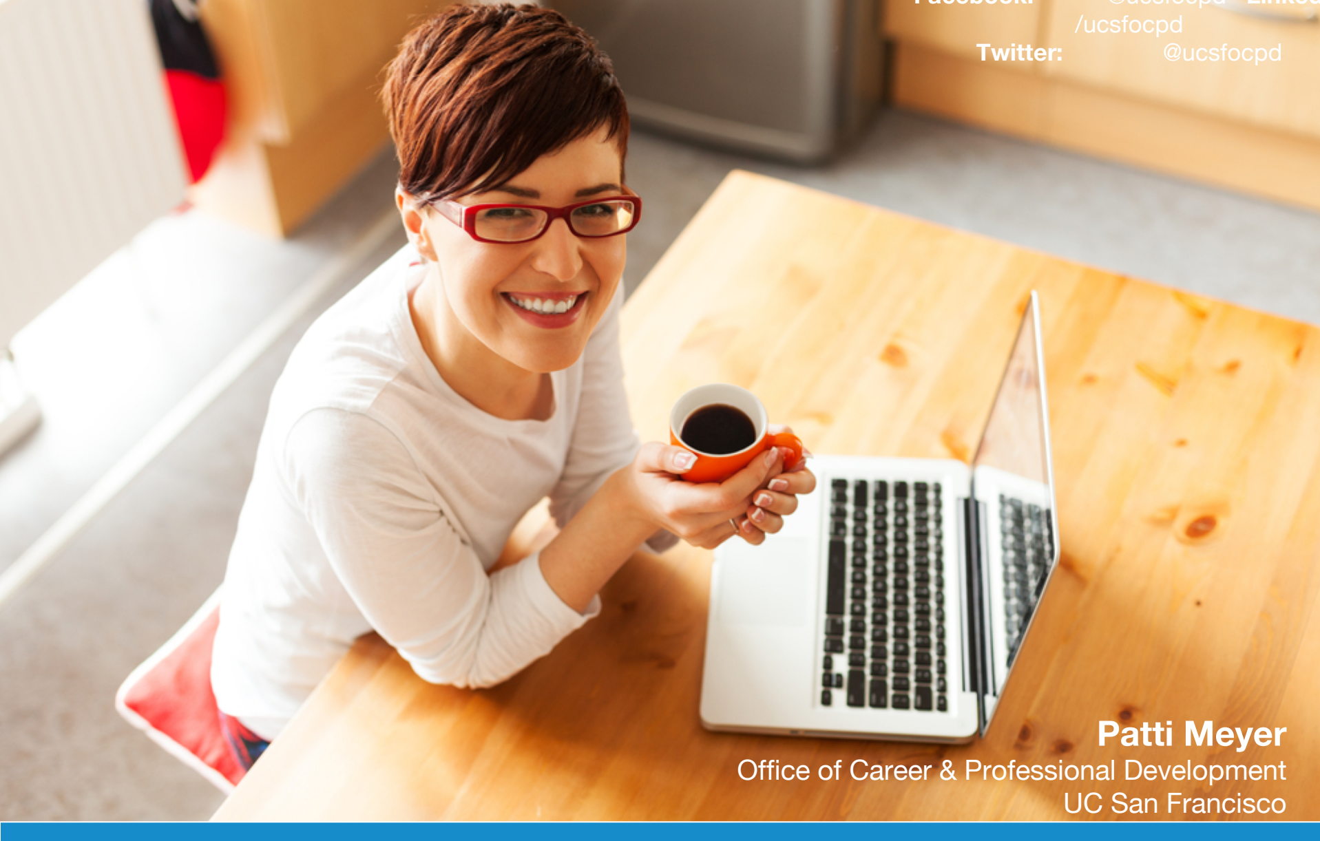
Consulting Application Materials Workshop